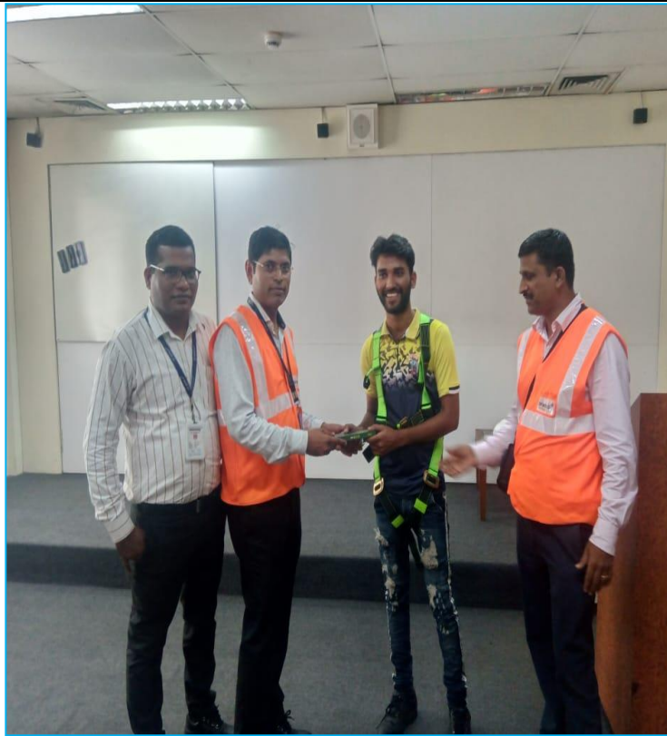
Awareness session with Wharf / Deck Checkers, Lashers.